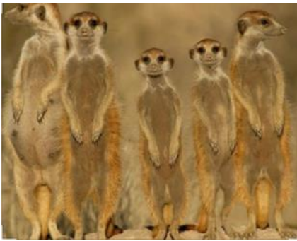
A rare picture of ISR Platoon members conducting a listening post.

In September we travelled to Townsville for the Battalion Military Skills competition, and finished with impressive results with composite teams consisting members from Gladstone and Mackay we managed to cross the line with second place, with the lads from Rocky taking the Cup with first.