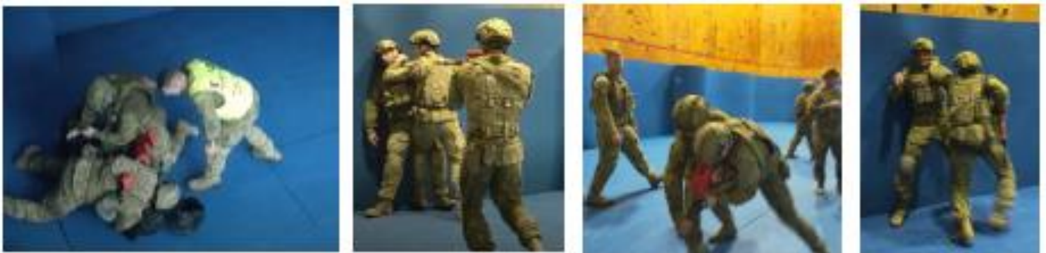
Army Combatives Program (ACP) Training