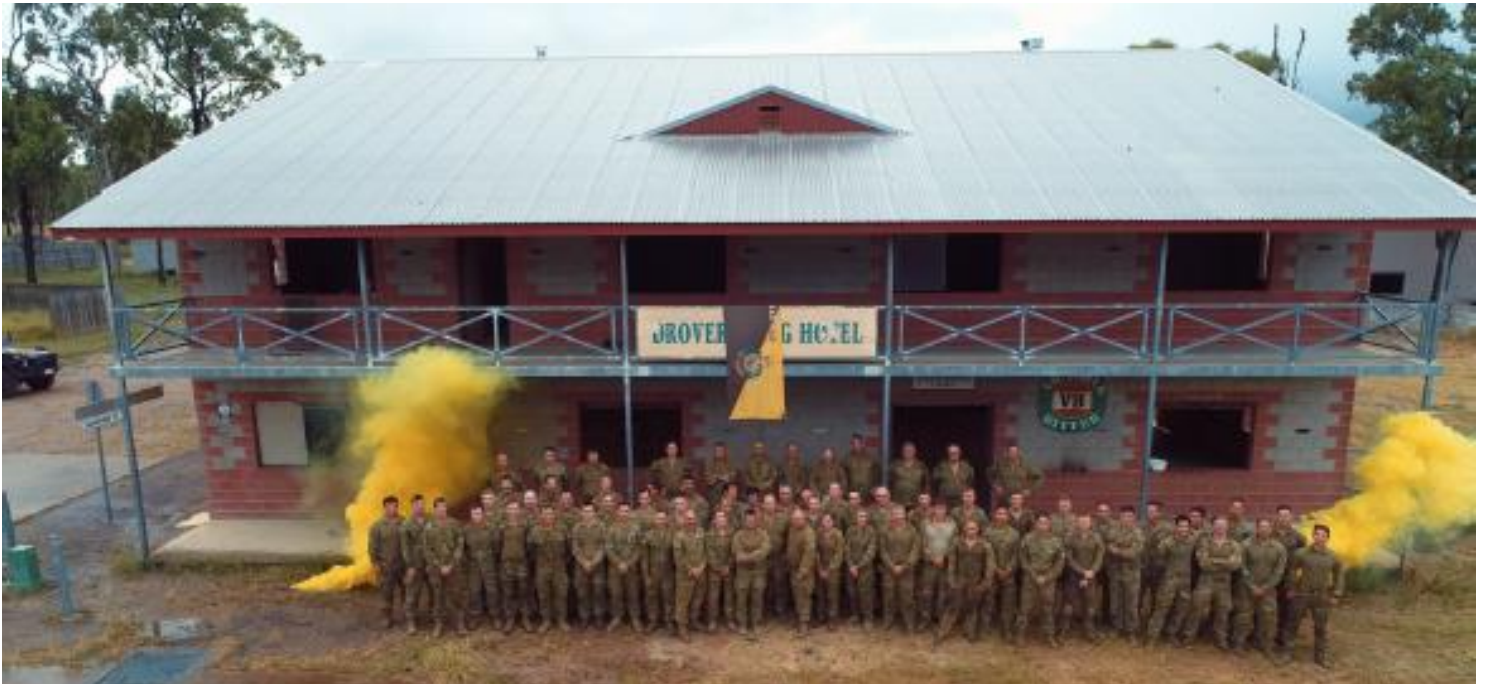
Members of 31/42 at Townsville Field Training Area

The Battalion now has a CT (-) nucleus ready to participate in EX Brolga Run and EX HAMEL 2020.