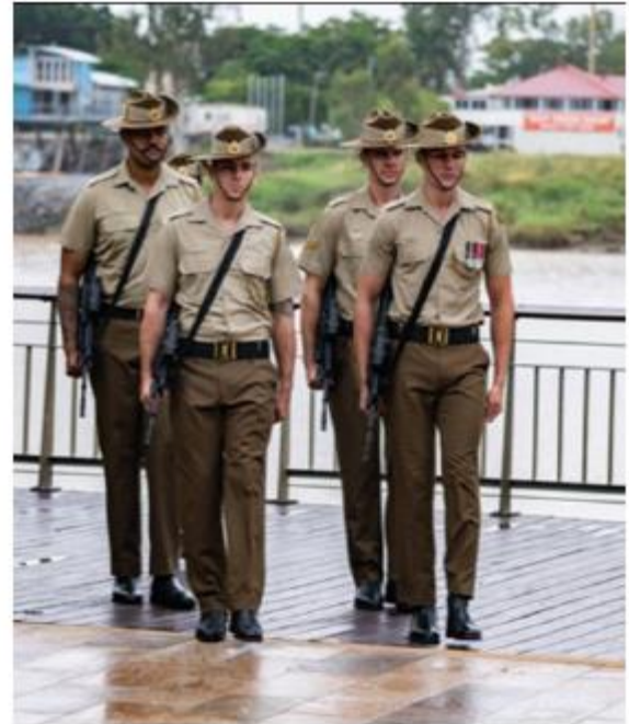
Rockhampton Catafalque Party – prior to mounting the Cenotaph